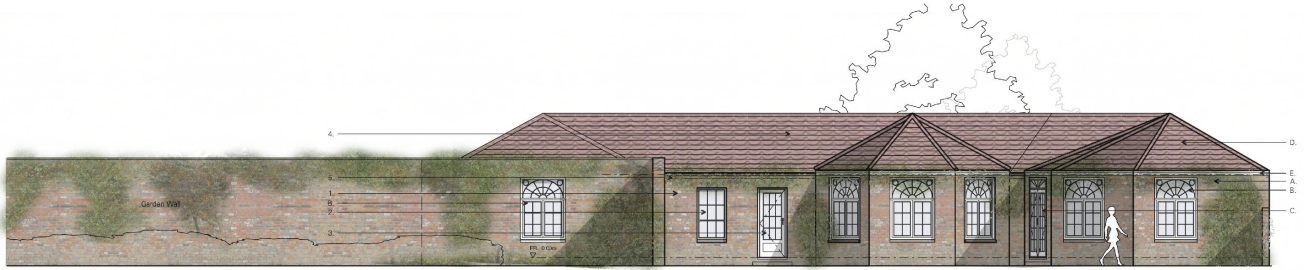
Proposed West Elevation Scale 1:100@A3