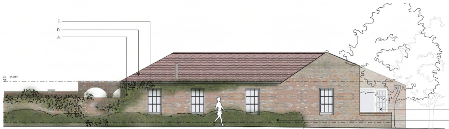
Proposed South Elevation Scale 1:100@A3