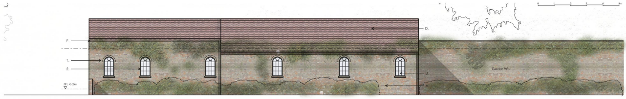
Proposed East Elevation Scale 1:100@A3